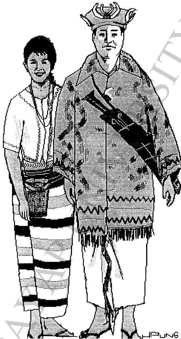
A Rawang Couple